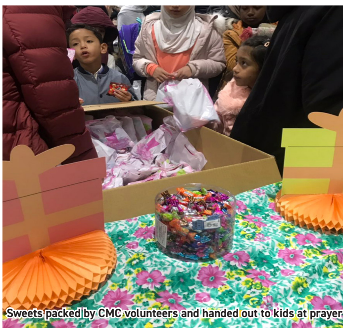
Sweets packed by CMC volunteers and handed out to kids at prayer.